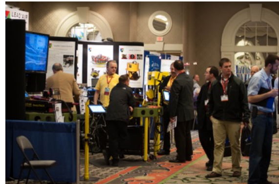
Exhibit Space Description and Cost

Exhibits will be in the same room as the breaks, sponsored meals and sponsored networking social. The exhibit hall is located between the Entrance Foyer and the General Session space – in the heart of the action. An agenda outline is included in this brochure. For a detailed conference agenda, download the program brochure from the website http://uasreno.org/ .